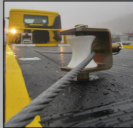
◆ REMOVABLE PULLEY