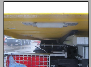
◆ ROLLERS FOR EASY SLIDING (for HK)