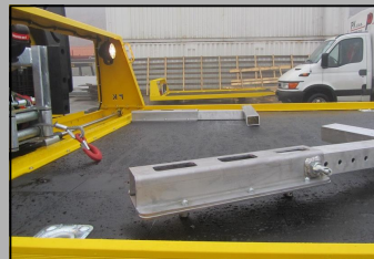
◆ REMOVABLE WHEEL CHOKS