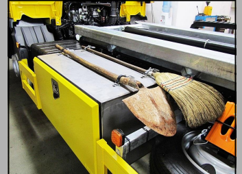
HOLDER FOR BROOM AND SHOVELS