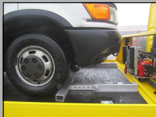
◆ WHEEL CHOKS EXTRACTED