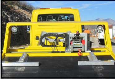
◆ REMOVABLE WINCH