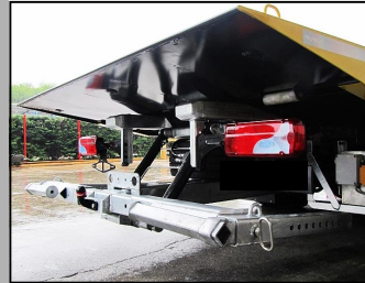
◆ TOWING FRAME