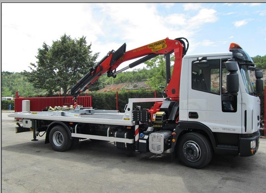
◆ WHEEL CLAMP