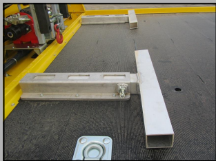
◆ WHEEL CHOKS RETRACTED