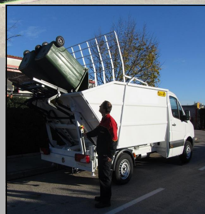
- rear tipper MK1 - thrust board - system for emptying cans

Self-compacting semitrailer PPK 020 is designed for waste compacting and transporting from waste transfer stations to the central county waste management centre. In addition to the system of waste compacting, this semitrailer has installed high-pressure wash system of loading space.